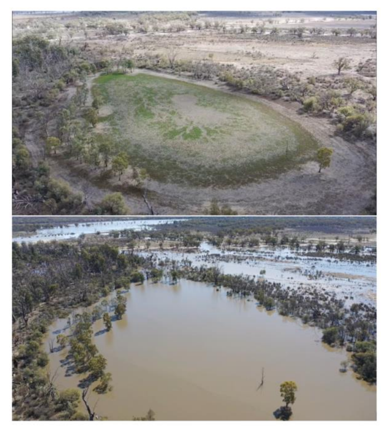
Figure 1: The Piggy Creek complex on the Katarapko floodplain, before and during the current environmental water operations